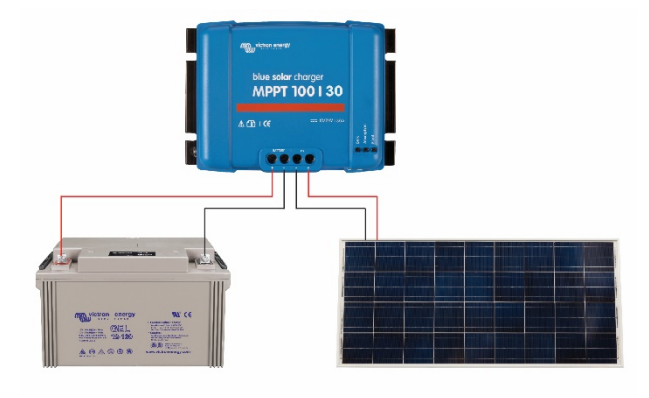
Figure 1: Power connections